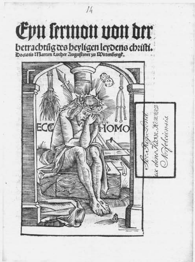
Title-page woodcut for a sermon by Luther on the suffering of Christ.