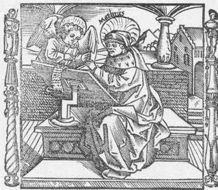
Saint Matthew, woodcut from the Zürich Bible, 1536.

As the lead article in this issue of Reformation Notes indicates, worship is